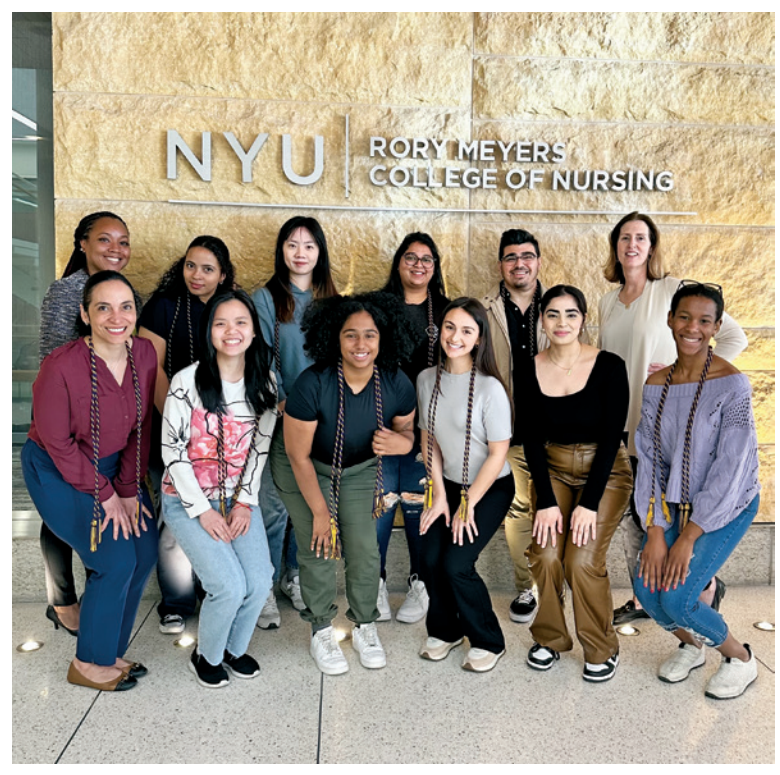
The HIGN Scholars Program seeks to engage and develop baccalaureate students interested in specializing in the care of the older adult through mentorship and additional training, utilizing the existing resources of HIGN and NYU Meyers.

Students practice wound care in the CSLC.