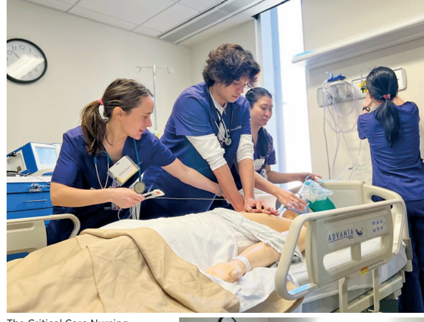
The Critical Care Nursing Student Association hosted a mock code event at the CSLC.