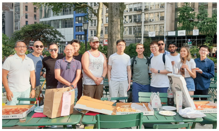
Alums and students gathered to enjoy a summer picnic in Madison Square Park.