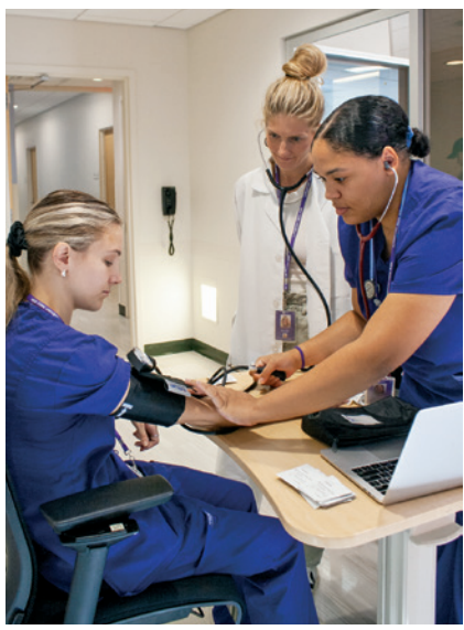
Students practice taking blood pressure readings.

Meyers students met several nurse managers who shared their insights on job applications and career development. The event was organized by Meyers student club MEN.