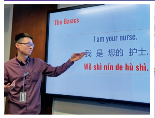
The API-NSA led a presentation on Chinese medical terminology for bedside nursing.