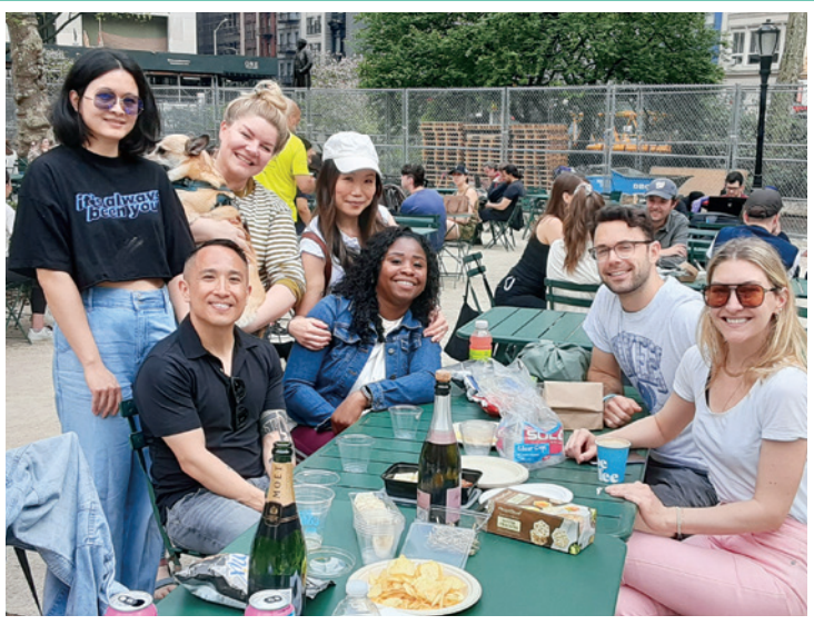
Meyers January 2023 grads celebrated passing the NCLEX by getting together for a picnic.