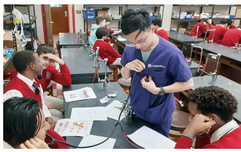
Meyers students returned to La Salle Academy to teach about health, nutrition, and diabetes.

UDAR hosts new student send-offs each summer all around the country! Here are some of our current students who attended the San Francisco event.